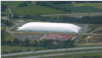
Generations Sports Complex Dome Muncy, PA