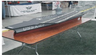
Land your Vapor or MCX on our aircraft carrier.