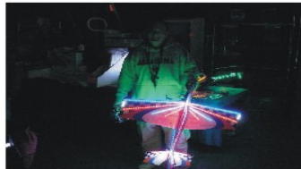
Bring your well lit aircraft for our night flying session .